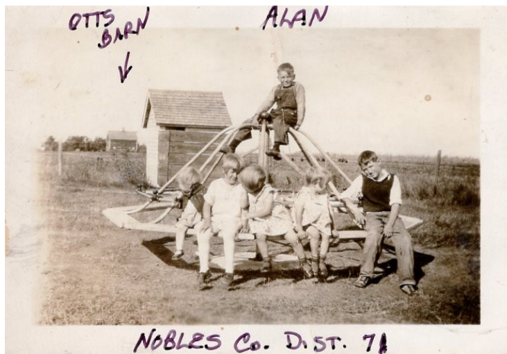
Photo From the Past