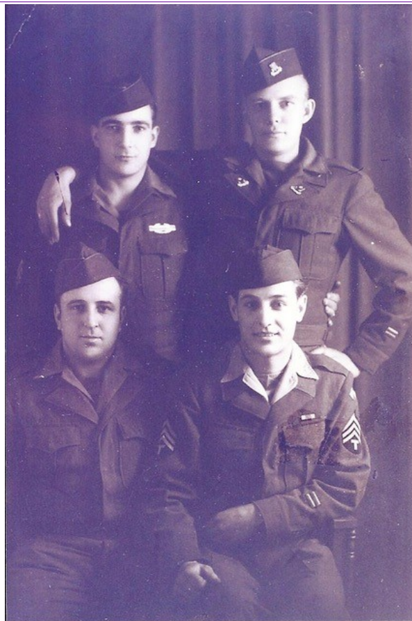
Photo From the Past