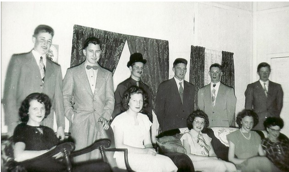
Photo From the Past

The Murray County Medical Center is an Equal Opportunity Provider & Employer.