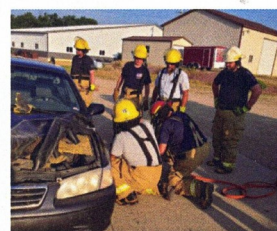
Training is on-going through the year

Your support of the Wilmont Fire & Rescue is greatly appreciated!