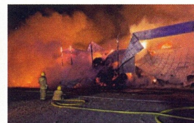
Fighting farm fire