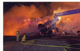
Fighting farm fire