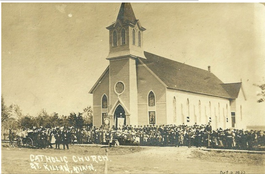
Photo From the Past

The American Legion Auxiliary's Give 10 to Education program collects donations of school supplies in multiples of ten. School supplies needs differ according to schools and grade levels so the first step is to check with the local school to see what is needed. The Schaap-Gallagan American Legion Auxiliary #636 in Lismore recently donated a supply of clothing items to Adrian Elementary School as a part of this program.