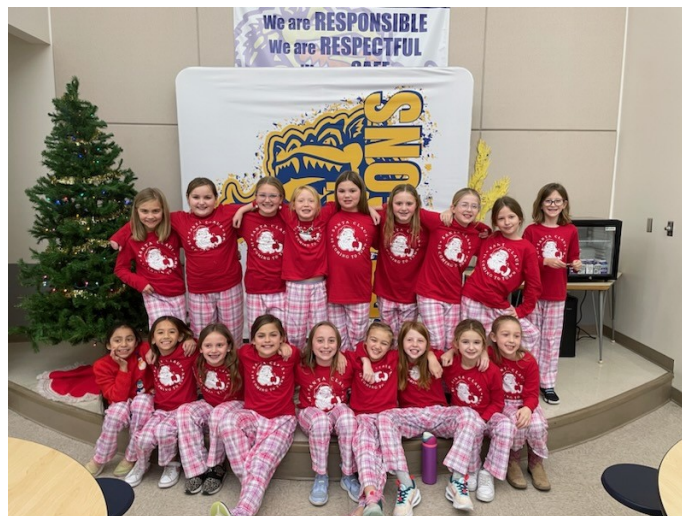
The 3rd grade girls made a fun Christmas memory by ALL wearing the same pajamas on Pajama Day at Adrian Elementary .