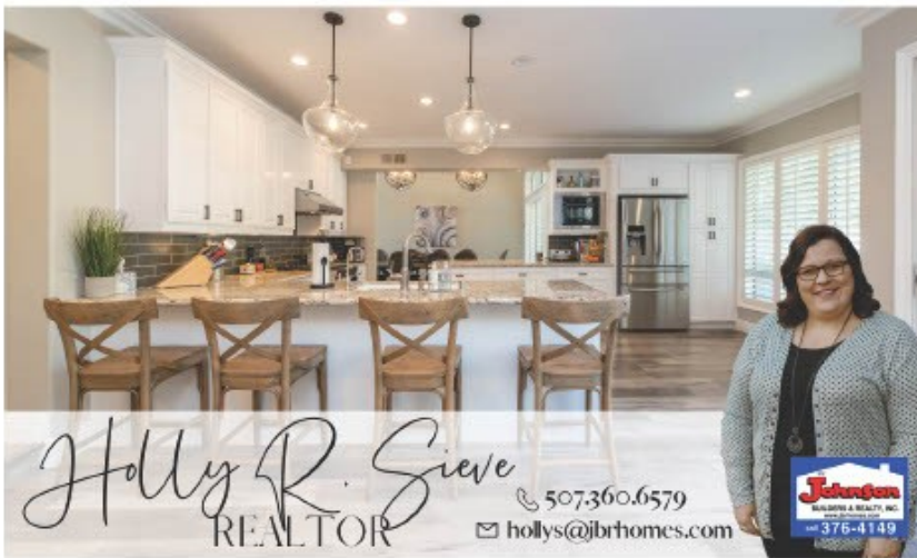
Check out Johnson's web site— https://jbrhomes.com —house for sale on 5th Ave. In Wilmont.