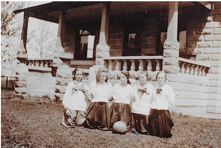
The 1920 team (2nd photo) played for the Wilmont Public School.

Watch for additional photos on Growing Up In Wilmont MN— What do you remember Facebook page