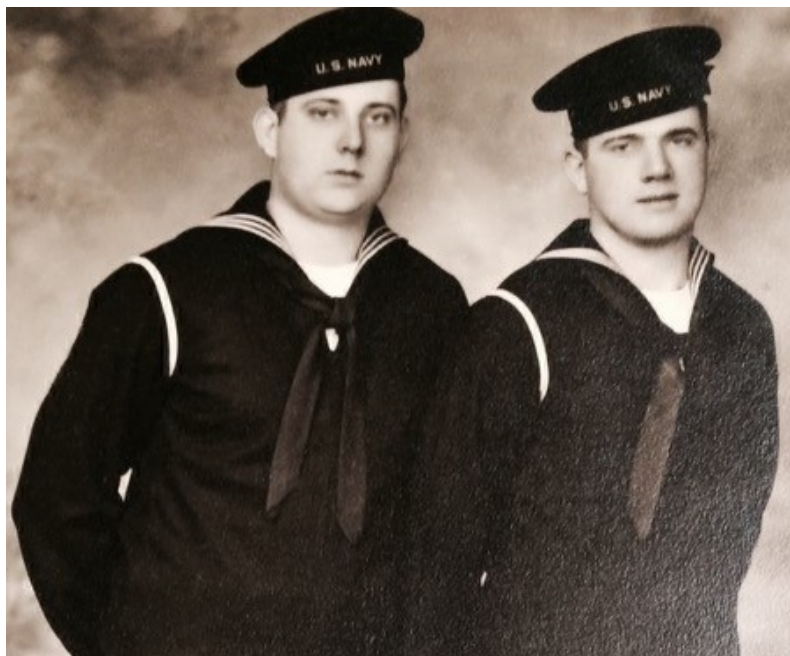
Photo From the Past