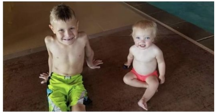
FRI, AUG 13 AT 6 PM CDT Cousins for Causes Iona, MN